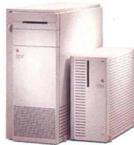
There are two Macintosh Quadra models. The 950 sits next to your desk; the 700 fits on top of it.

Macintosh Quadra helps people work together, too. File sharing and networking are both built in, making it possible for anyone to build a network simply by plugging in a cable. For high-performance networks, Ethernet is built in as well.