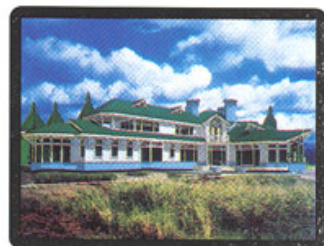
With accelerated 24-bit video support built in, Macintosh Quadra brings spectacular, photo-quality color to programs like ArchiCAD and ArchiTron without the expense of an extra video card.

And Macintosh Quadra runs thousands of business programs at screaming speeds, including Lotus 1-2-3, WordPerfect and PowerPoint. To help you with every aspect of your business.