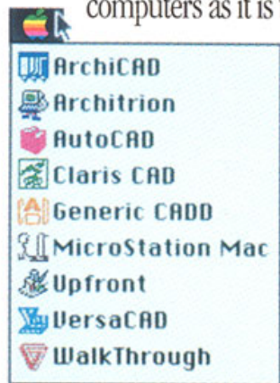
Macintosh Quadra runs all the most powerful design and architecture software.

The notion of integrating into an environment rather than overwhelming it, of complementing what already exists rather than eliminating it, is as relevant to the architecture of computers as it is to the architecture of buildings.