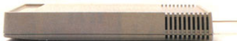
This is an Apple modem. Not much to look at, we admit, but it does let you pay bills and trade stocks by phone. It also connects your Apple II to a wealth of information services, like THE SOURCE™ and CompuServe®.

using an Apple modem, you'll gain instant access to financial news sources like The Wall Street Journal , Barron's , and the Dow Jones News/Retrieval® service. Find out what they've been saying on Wall Street Week . And in most cases, get up to the minute price quotes on over six thousand stocks, options, and other securities.