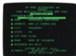
It can manage your entire stock portfolio with programs like Dow Jones Investor's Workshop® and Charles Schwab and Company's The Equalizer®. It can even show you what's going on in your bank account.*

An Apple II can do wondrous things for your personal finances. With several different software programs, you can become your own stockbroker. Again, by