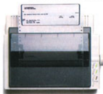
With our Scribe® color/graphics printer, you can automatically print out your own checks—not to mention reports, papers, almost anything. Except money.

Or a fur-lined boat, if your budget permits.