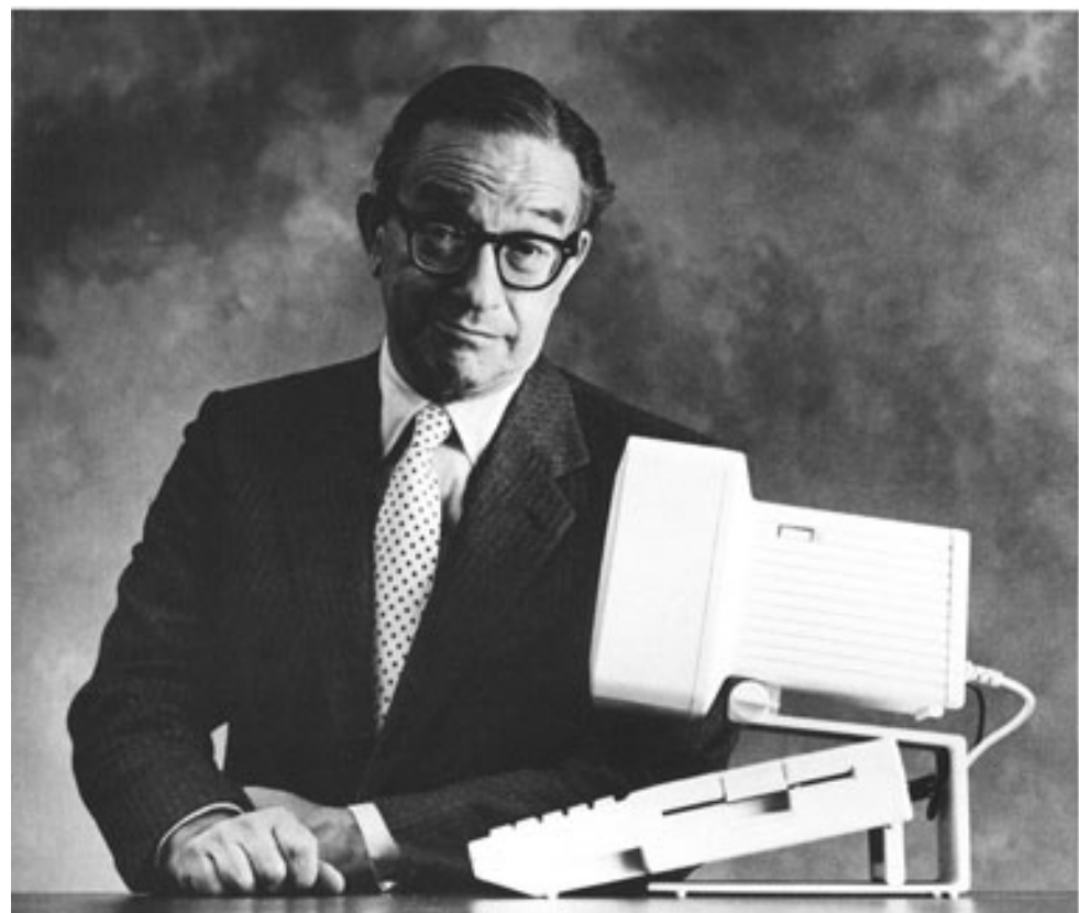
Alan Greenspan, Famous Economic Advisor

"The other day, a prominent politician in the executive branch of our government phoned me up.