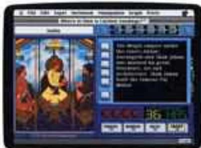
Bridget Jones's Diary Where in Time is Carmen Sandiego?

Yet the list of benefits doesn't stop there.