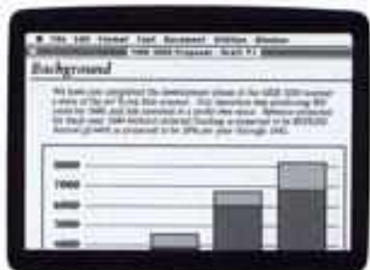
Informational Support of 0

Naturally, it features the intuitive, graphics-based interface that Apple pioneered. And it runs thousands of applications, from basic word processing to sophisticated databases.